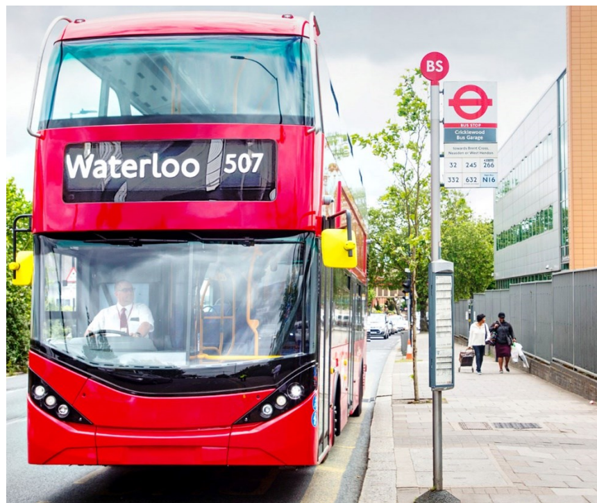
A Navaho Transport systems destination blind on the ADL Enviro 400 EV

Nominate a marketing contact who will be included in the editor's monthly process of 'chivvying'.